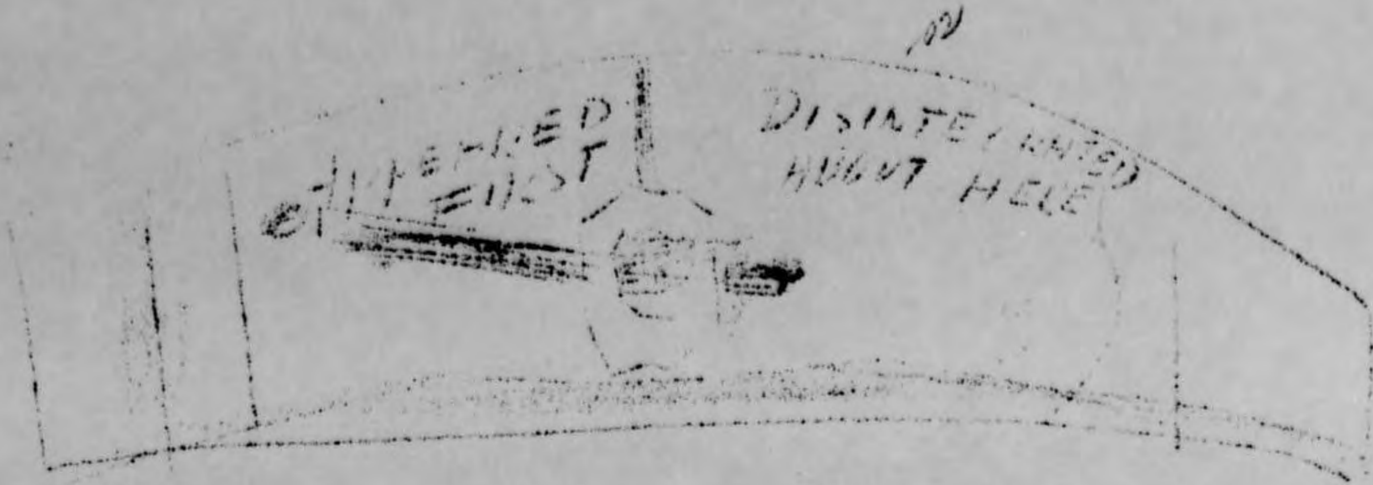
SKETCH: View from Interior of C-47 Aircraft