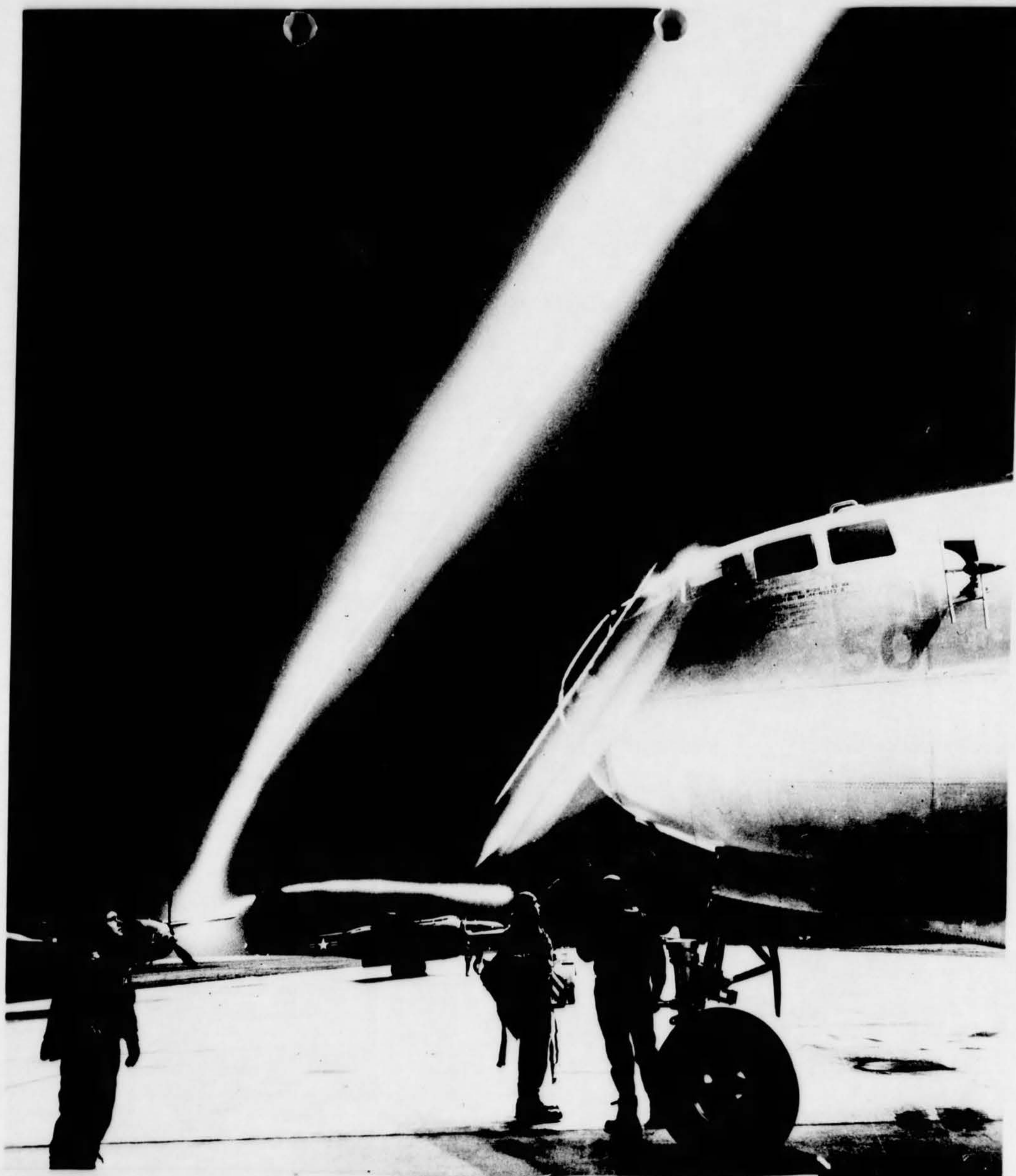
Photo # 4 Time exposure of the "HELL ROARER" at night. Path of the A/C starts at the lower center of the picture.