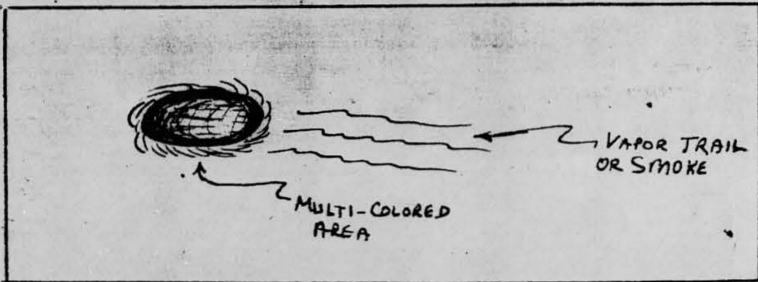
PICTURED IN BOX IS OBJECT AS SEEN THROUGH 60-POWER TELESCOPE

NOTE: THIS DOCUMENT CONTAINS INFORMATION AFFECTING THE NATIONAL DEFENSE OF THE UNITED STATES WITHIN THE MEANING OF THE ESPIONAGE ACT, 50 U. S. C. — 31 AND 32, AS AMENDED. ITS TRANSMISSION OR THE REVELATION OF ITS CONTENTS IN ANY MANNER TO AN UNAUTHORIZED PERSON IS PROHIBITED BY LAW. IT MAY NOT BE REPRODUCED IN WHOLE OR IN PART, BY OTHER THAN UNITED STATES AIR FORCE AGENCIES, EXCEPT BY PERMISSION OF THE DIRECTOR OF INTELLIGENCE, USAF.