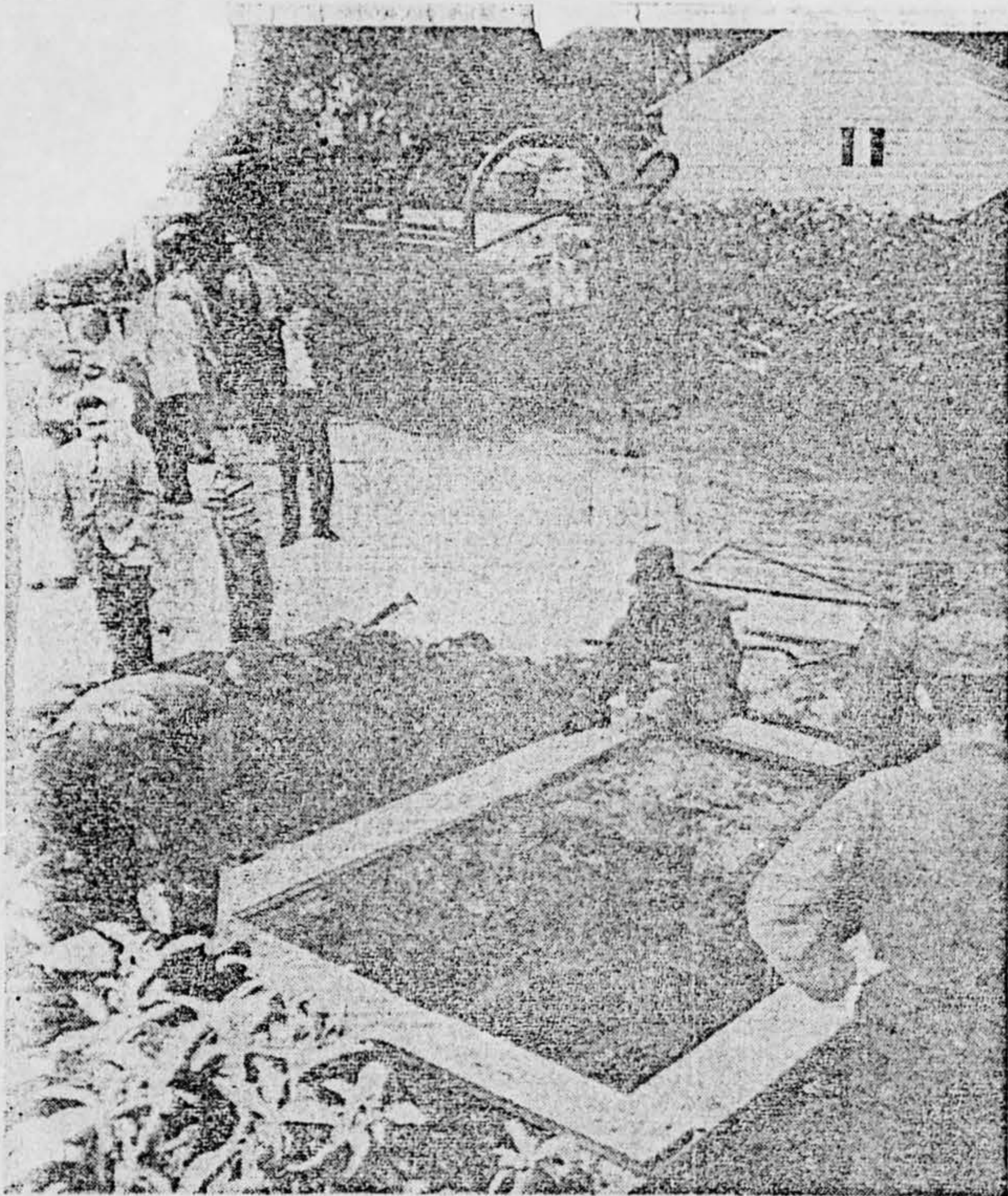
DIG FOR SOLUTION —Army Ordnance experts dig in back yard of San Gabriel home in search of mysterious object that may have rocketed out of sky and plummeted into earth there. They planned to dig to depth of 20 feet if it is necessary.