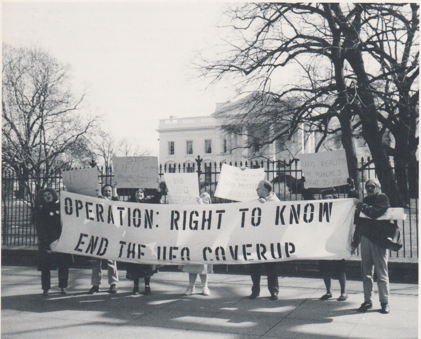
WASHINGTON UFO DEMONSTRATION