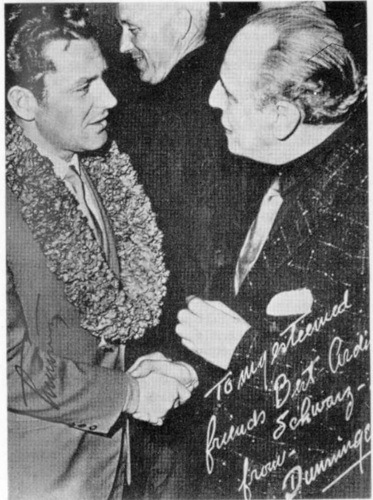
Autographed photograph of Joseph Dunninger and Vladimir Komorov, cosmonaut, who died April 24, 1967, when descending to earth and his space capsule parachute failed to open