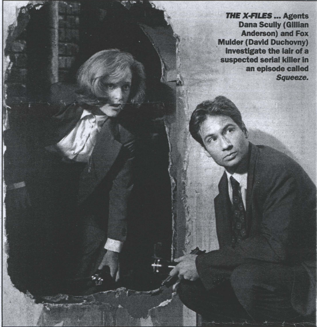
THE X-FILES ... Agents Dana Scully (Gillian Anderson) and Fox Mulder (David Duchovny) investigate the lair of a suspected serial killer in an episode called Squeeze .

The X-Files shows promise of gaining a similar hold on its audience. Years from now, viewers may vividly recall Ice , about the unearthing of an unearthly Arctic para-