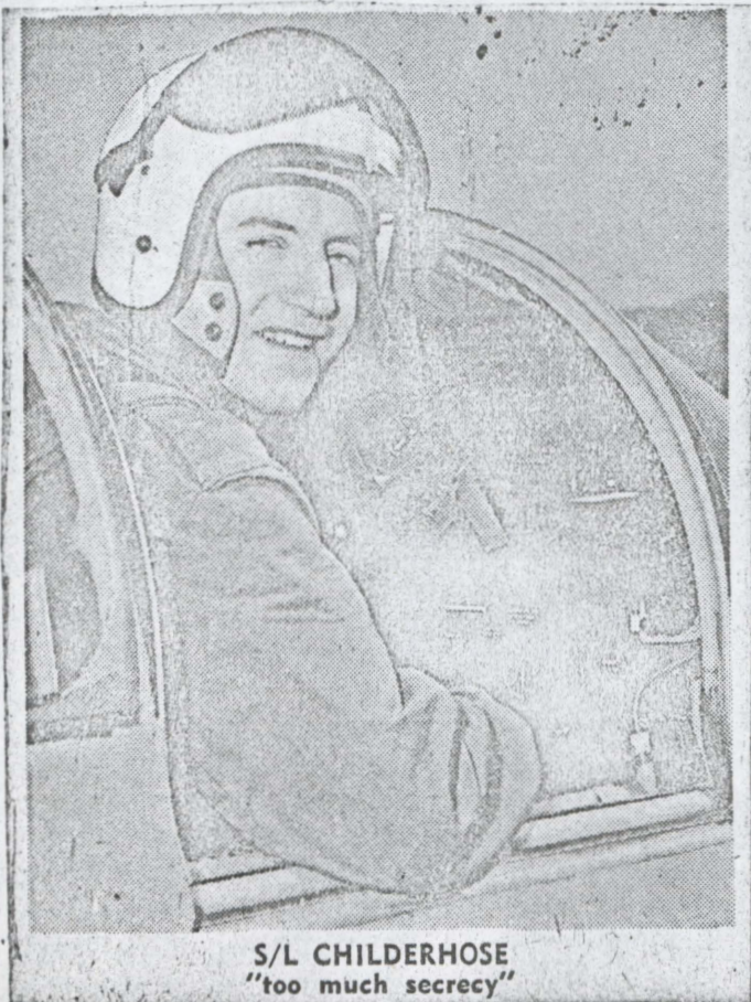
S/L CHILDERHOSE "too much secrecy"

On Feb. 28, 1904, off San Francisco, the crew of the U.S.S. Supply watched a formation of bright discs fly by in line then switch to an