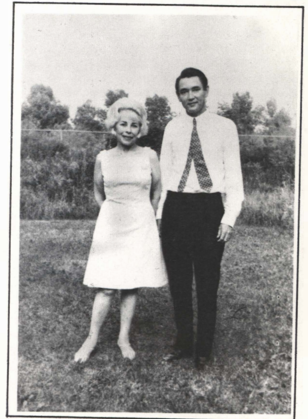
Your Editor, and co-worker.