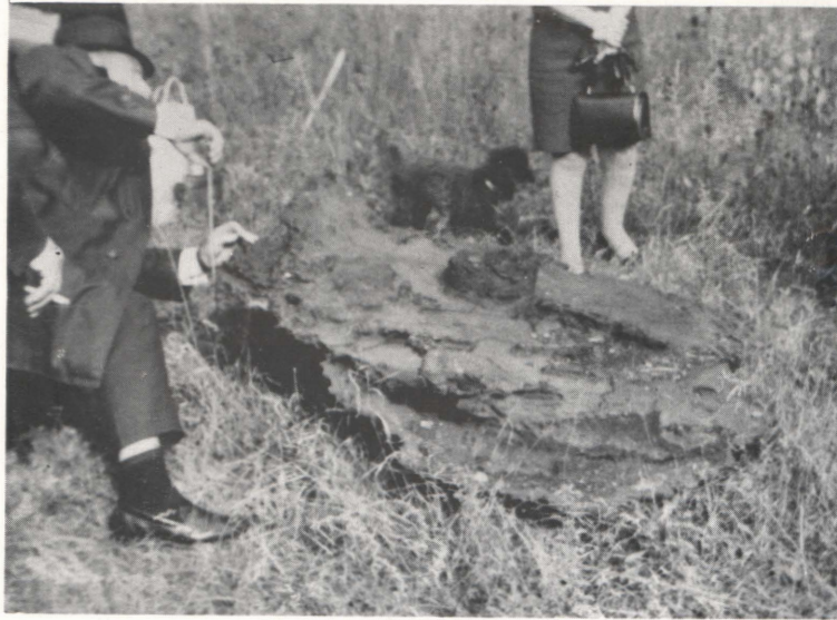
Measuring the mass of metal.