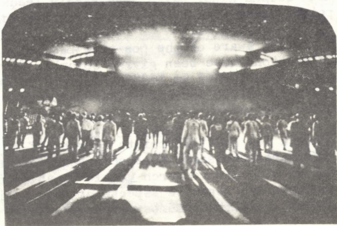
Moment of revelation: Close Encounters of the Third Kind