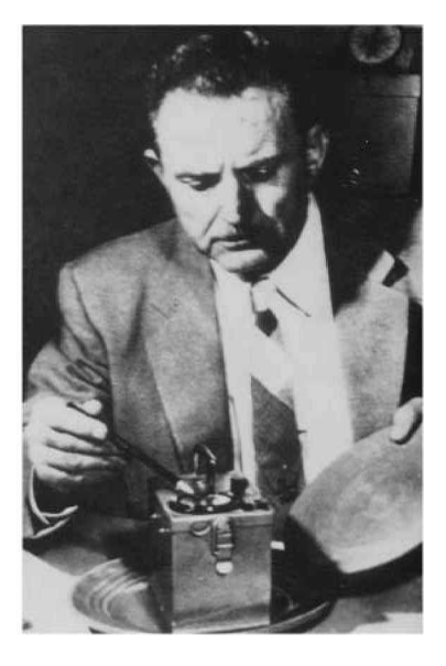
Fig. 5. Lincoln LaPaz, world meteor expert.