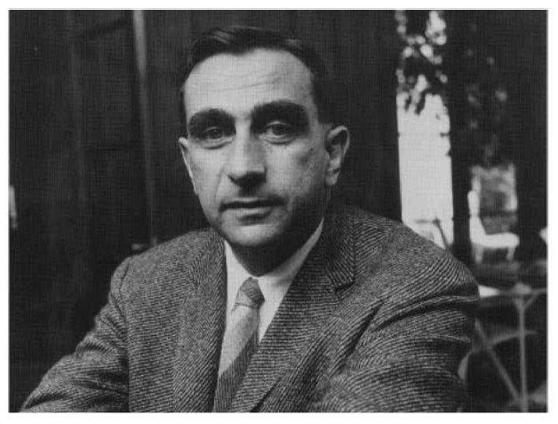
Fig. 4. Edward Teller, inventor of the hydrogen bomb.

between 35 and 40 miles. This would make the object 500 to 1000 feet in diameter from the Mill scale on the theodolite. The object appeared to be somewhat egg-shaped with one edge a faint orange or burnt brown color.