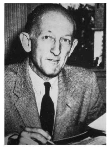
Fig. 2. Donald Keyhoe, marine major.

A ballistics man attached to the Skyhook group made some calculations on the missile and figured the velocity to be in the order of three to five miles per second, altitude