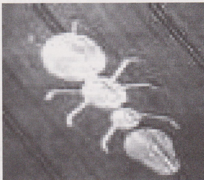
The Henwood Down formation, July 25, 1997, Hampshire, England.

As he implied in his book The Circles Effect and its Mysteries , p. 20, fair weather whirlwinds or ordinary atmospheric vortices could not be responsible. And we of course know that most of the crop-circle formations have occurred at night, and even under damp weather conditions, when summer whirlwind activity is absent or minimal.